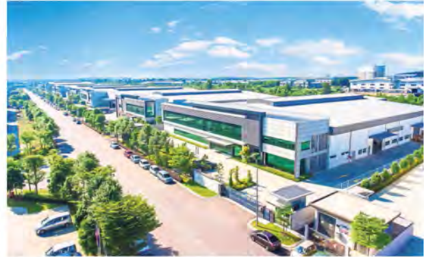
i-Park@Indahpura is a model of clean and green industry.

A SHINING example of sustainability, functionality and evergreen usability, i-Park@Indahpura in Iskandar Malaysia, Johor, is a world-class industrial development designed with today and tomorrow in mind.