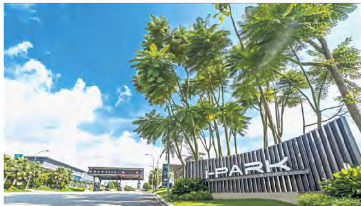
The grand entrance to i-Park@Indahpura in Iskandar Malaysia, Johor.

All these have taken the notion of an industrial park development to