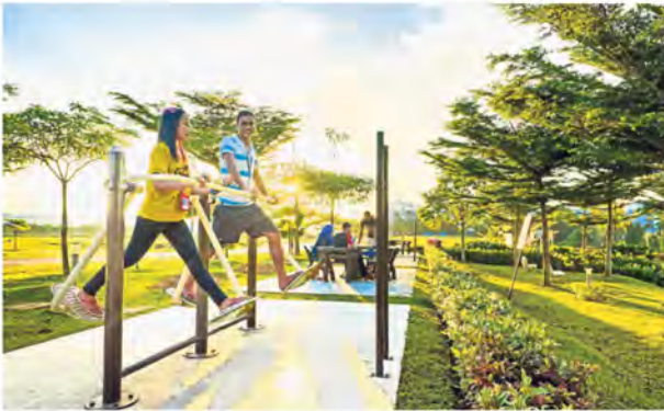
Outdoor gym facilities at the Recreational Park allow one to work out.